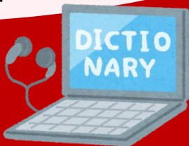
an electronic dictionary