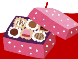
a box of chocolate